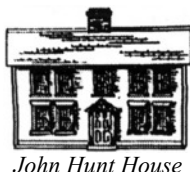
John Hunt House

East Providence Historical Society P.O. Box 4774 East Providence, RI 02916