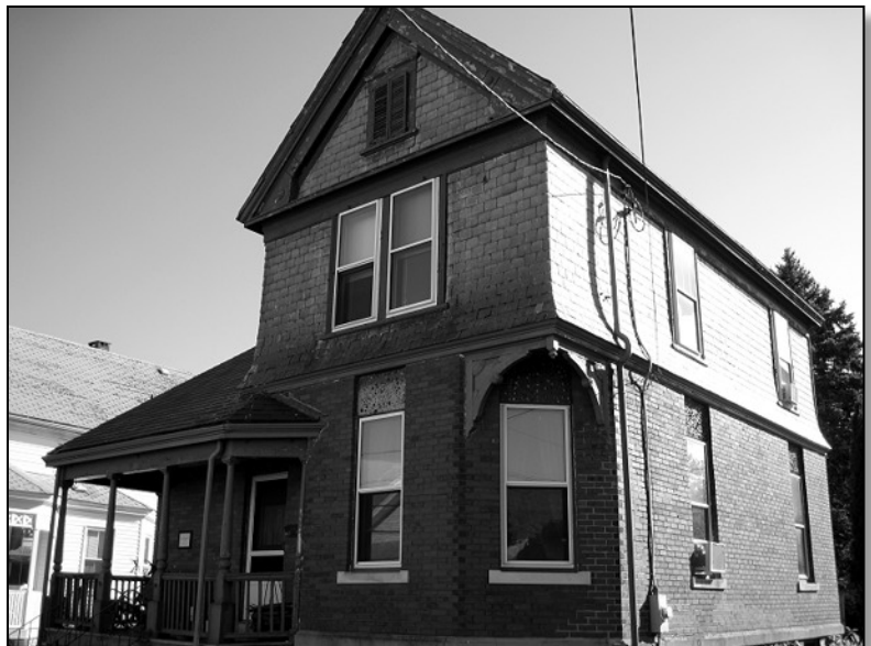
Dot Thornley, Photo

East Providence Historical Society P. O. Box 4774 East Providence, RI 02916-4774