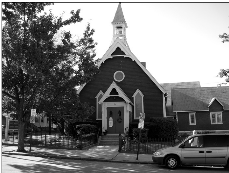
Dot Thornley, Photo Beautiful St. Mary's, our host home for the Watchemoket Square Day events.